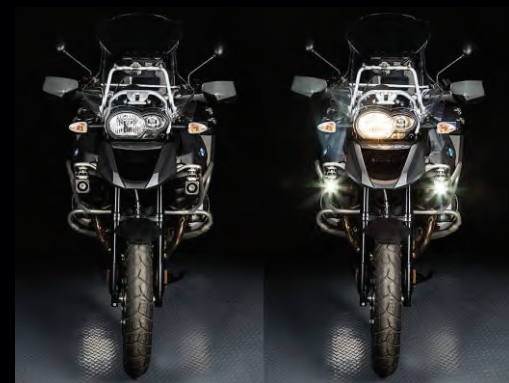
LUXOR-WL-1S-SF 1" SQUARE LED WORK LIGHT INSTALLED ON MOTORCYCLE