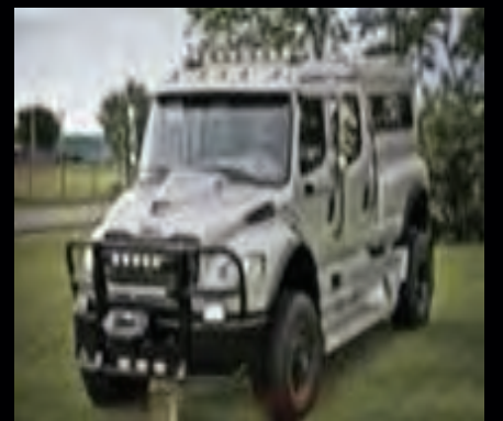
LUXOR-WL-1S-SF 1" SQUARE LED WORK LIGHT INSTALLED ON F650