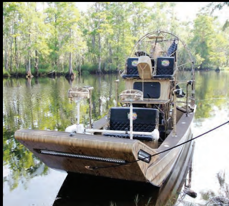
LUXOR-LB2-41-SF 41" LIGHT BAR INSTALLED ON SWAMP BOAT