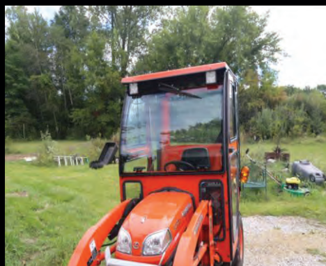
LUXOR-WL-4S-SF 4" SQUARE LED WORK LIGHT INSTALLED ON TRACTOR