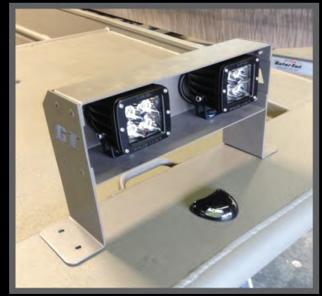
LUXOR-WL-2S-SF 2" SQUARE LED WORK LIGHT INSTALLED ON BOAT