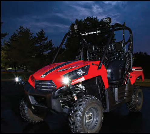
LUXOR -WL-2S-SF 2" SQUARE LED WORK LIGHT INSTALLED ON ATV