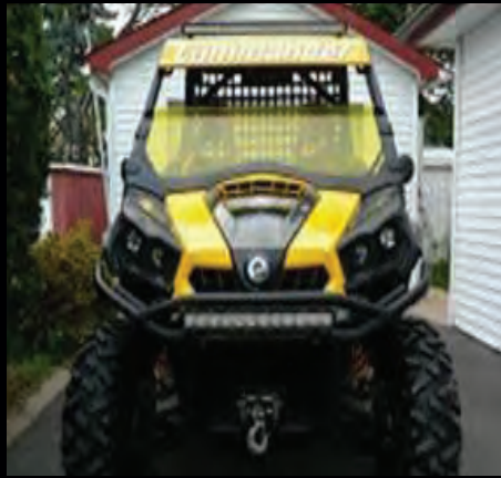
LUXOR-LB2-31-SF 31" LIGHT BAR INSTALLED ON ATV