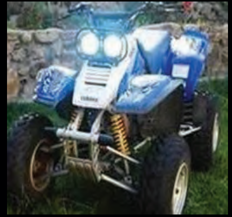
LUXOR-WL-4R-SF 4" ROUND LED WORK LIGHT INSTALLED ON QUAD