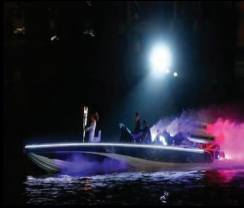
LUXOR-WL-4RT-SF 4" RECTANGULAR LED WORK LIGHT INSTALLED ON SPEED BOAT